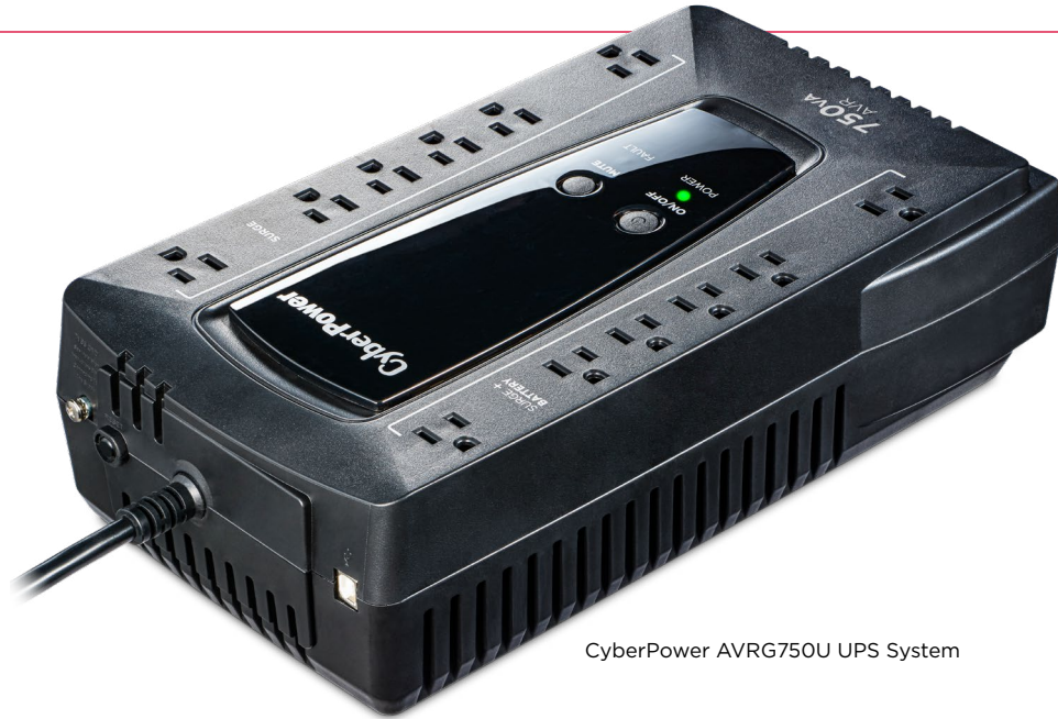
CyberPower AVR750U UPS System

From basic to advanced power protection, CyberPower is your ultimate ally in power. To learn more, contact a CyberPower sales associate and or visit https://www.cyberpowersystems.com/products/ups/avr .