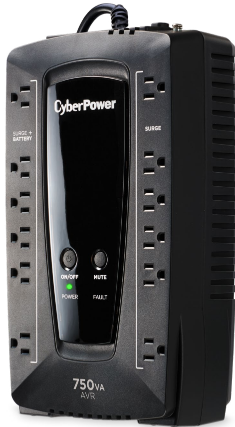
CyberPower AVR750U UPS System